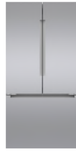
3 Door Stainless Steel Recessed Handle B36CT81ENS