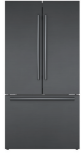
3 Door Black Stainless Steel Bar Handle B36CT80SNB