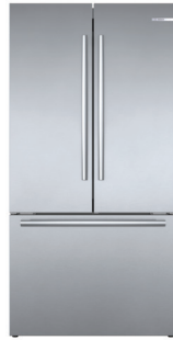
3 Door Stainless Steel Bar Handle B36CT80SNS