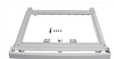
Stacking kit: Without Pull-out Tray WTZ20410UC