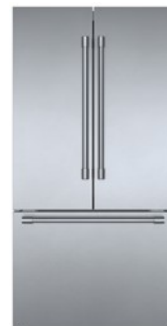
3 Door Stainless Steel PRO Handle B36CT81SNS