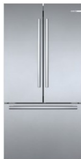
3 Door Stainless Steel Bar Handle B36CT80SNS