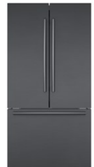
3 Door Black Stainless Steel Bar Handle B36CT80SNB