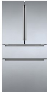
4 Door Stainless Steel Recessed Handle B36CL80ENS