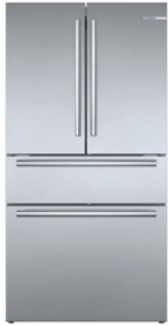
4 Door Stainless Steel Bar Handle B36CL80SNS

Revolutionary Bosch counter-depth refrigerators, with streamlined interior and an advanced freshness system that keeps the ingredients you love fresher longer. Enjoy less food waste, and more thoughtful design.