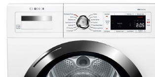
800 Series with Home Connect™ WTG865H3UC