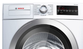
500 Series WTG86401UC