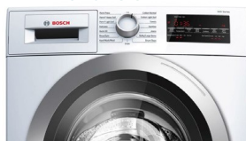
500 Series WAT28401UC