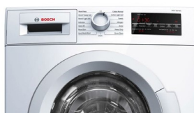
300 Series WAT28400UC