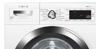
800 Series with Home Connect™ WAW285H2UC