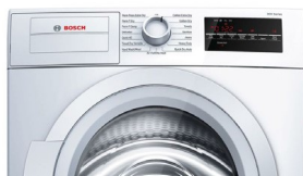
300 Series WTG86400UC