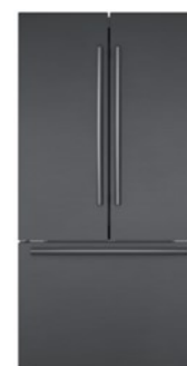
4 Door Stainless Steel Bar Handle B36CL80SNS