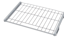
HEZTR301 30" Telescopic Rack