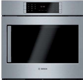
HBLP451RUC Stainless Steel

The Bosch wall oven features a SideOpening door for easier cavity access and a high-resolution TFT user interface.