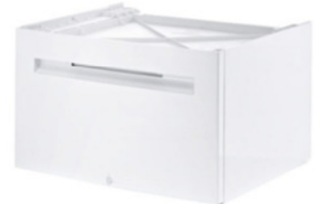
Washer Pedestal: WMZ20490 Dryer Pedestal: WMZ20500

For more information on the entire line of 24" Compact Laundry, visit www.Bosch-home.com/us .