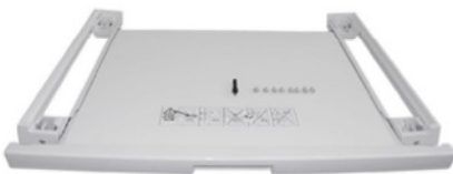
Pull Out Tray Stacking Kit WTZ11400