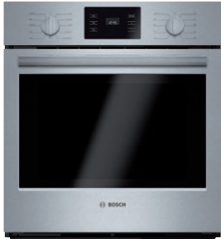
HBN5451UC Stainless Steel

The Bosch wall oven features Genuine European Convection and heavy metal stainless steel knobs.