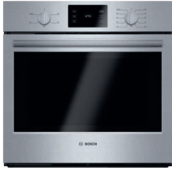
HBL5351UC Stainless Steel

The Bosch wall oven installs flush and features heavy metal stainless steel knobs.